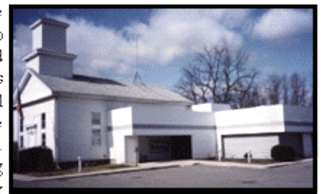
The beginnings on Stone Street.

The library began, temporarily, on a card table in the old Township Hall on Stone Street while waiting to move into its new home next door. The building used as the office for the Hamburg Lumber Company was physically moved to the lot next to the Township Hall and was ready for the new library in April 1967. The building was 920 square feet, plus a full basement. The fines for late books were $0.05 a day and Doug Sheperdigian was the first person to receive a library card.